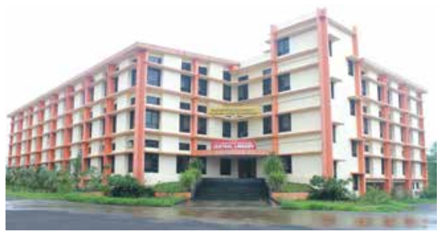
B.K.L. Walawalkar College of Physiotherapy