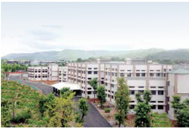
B. K. L. Walawalkar Rural Medical College