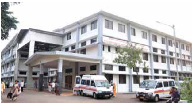
B.K.L. Walawalkar Hospital